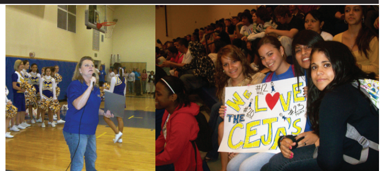
Last Pep Rally Honoring Our Fall Sports Teams- Jan. 26th.