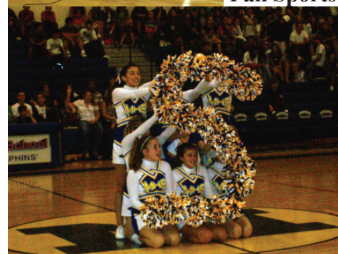
Cheerleaders and fans at work!