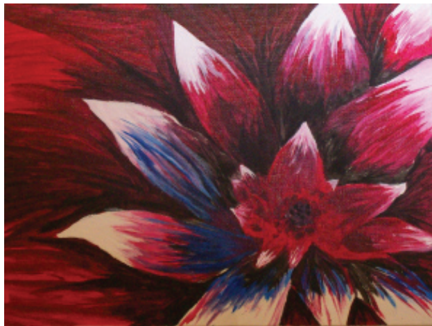
Growing Passion by Denise Sosa 9" x 12" acrylic on canvas.

A vibrant flower in reds, pinks, blues and white can liven up even the darkest room. And after looking at this image it even brightens up its dark crimson background like only a flower can. With differing paint edges both hard and soft, it creates a striking image of a flower worthy enough for any Hawaiian princess.